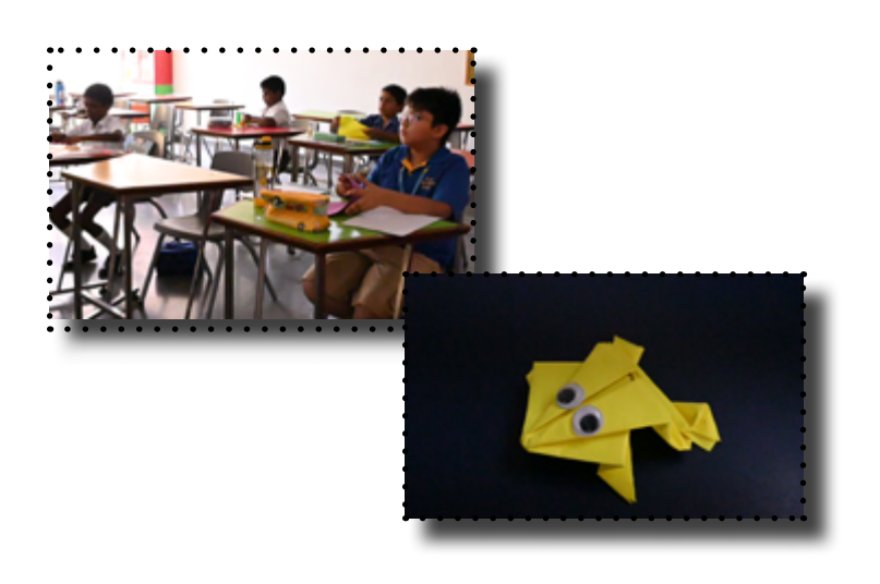
- Navanidha, Grades 12