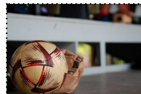
- Deepika, Grade 9 D